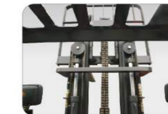
Excellent top view