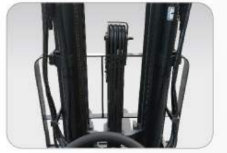
Excellent down view