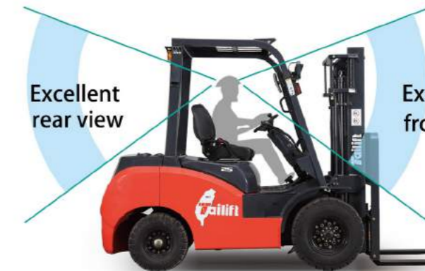
Excellent rear view